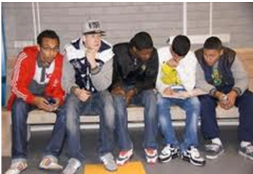
Leerling-populatie en opschaling zorg